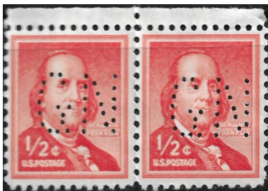
Perfin "GN" for Great Northern Railway

The invention of perfin stamps spread across the globe to a great many countries. The U.S. came late to this practice in 1908. Originally perfin stamps were considered damaged stamps and were not valued by collectors. However, today perfins are actively sought after by collectors around the world.