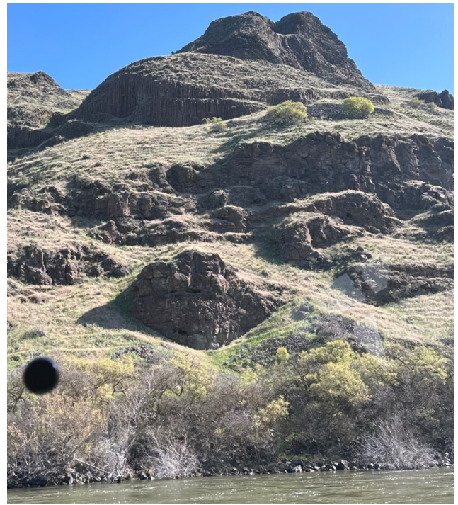
"Smugglers Rock" in the foreground.

He pointed out a rocky outcrop near the start of the gorge calling it "Smugglers Rock". It was said that in the days of Prohibition supplies of liquor were hidden behind this rock. When out of sight from the town, the mail boat would pick these up for delivery to customers further up the gorge. True story? Who knows but it was entertaining!